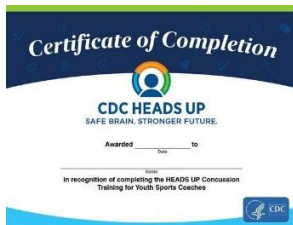
HeadsUp or NFHS (choose one)