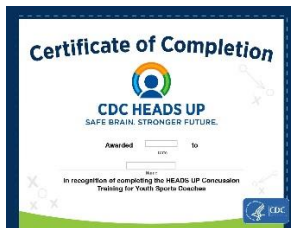
HeadsUp -OR- NFHS (choose one)