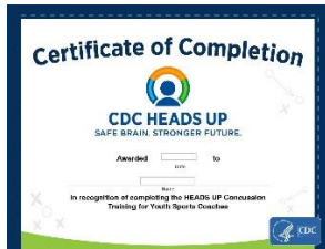
HeadsUp -OR- NFHS (choose one)